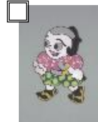
⑧Dangobei, Ofuji’s cartoon character