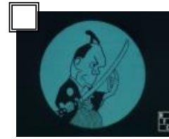
②“The Dull Sword” [the longest, digitally restored version] (1917, Junichi Kouchi)