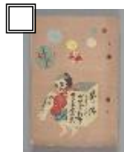
⑥Script for “Where Did Dumpling Go?” (1937, Noburo Ofuji)