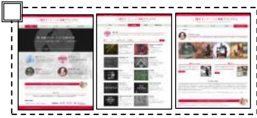
①(Web Page Image)

*When using any of the images 2-8, be sure to publish them with the designated credit captions, which are shown directly below the images.